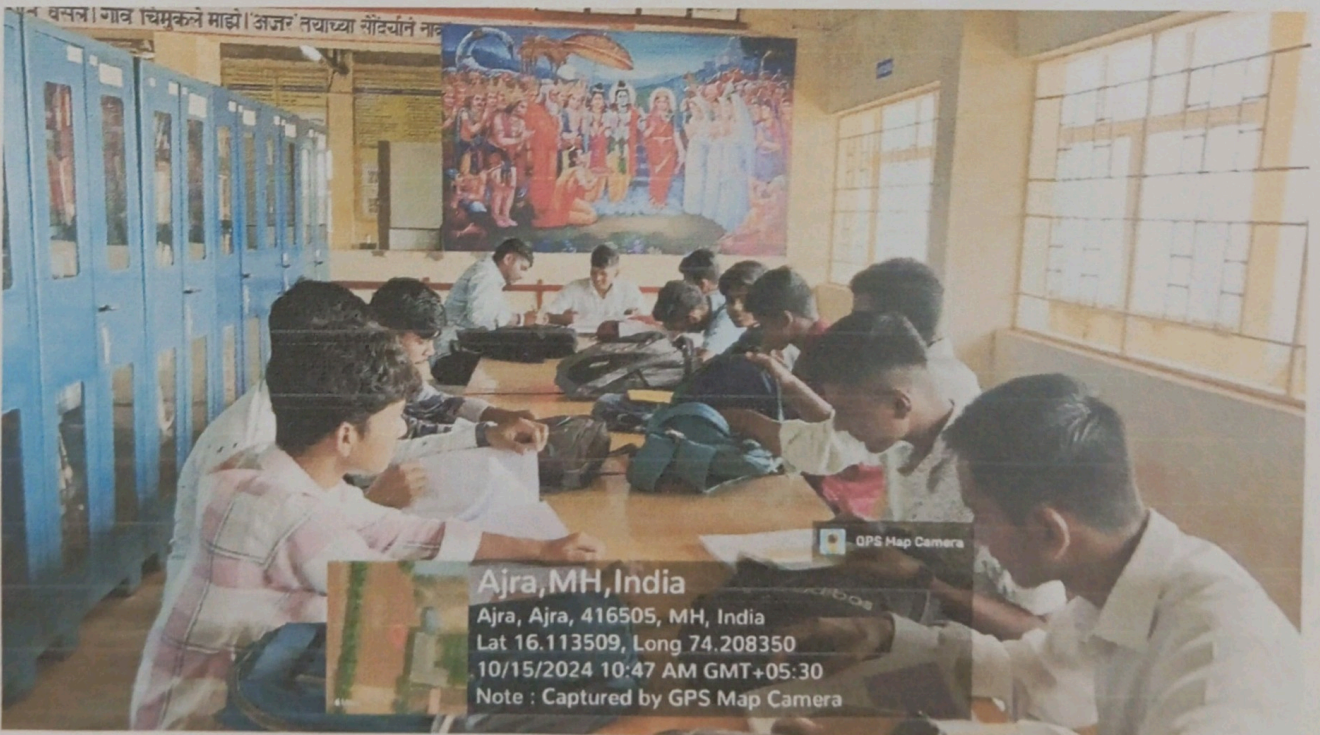
Students in the Library during the examination