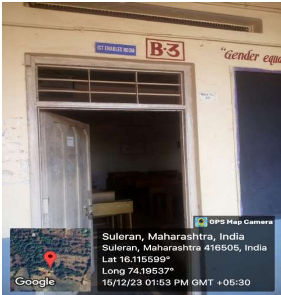
ICT Enabled Room B-3