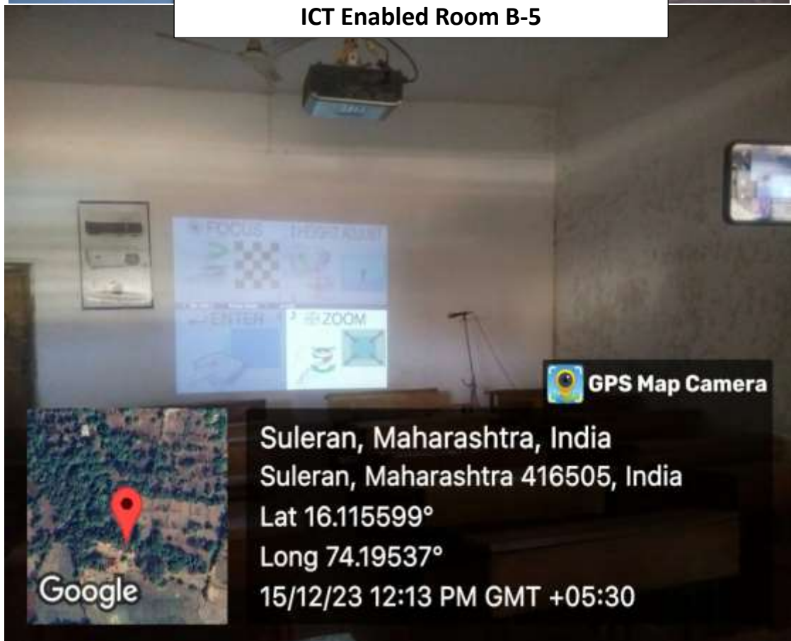
ICT Enabled Room B-5

Suleran, Maharashtra, India Suleran, Maharashtra 416505, India Lat 16.115599° Long 74.19537° 15/12/23 01:53 PM GMT +05:30