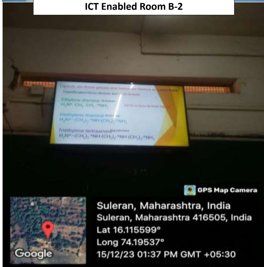
ICT Enabled Room B-2

Suleran, Maharashtra, India Suleran, Maharashtra 416505, India Lat 16.115599° Long 74.19537° 15/12/23 01:53 PM GMT +05:30